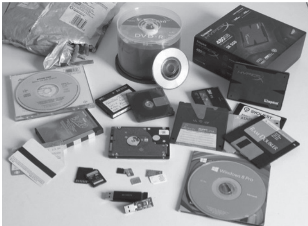
Figure 2. An example of how the digital portion of a personal archive could show up: please note the presence of many obsolete storage media (floppy disk, DAT, DCC, Mini Disk, LS-120, etc.)