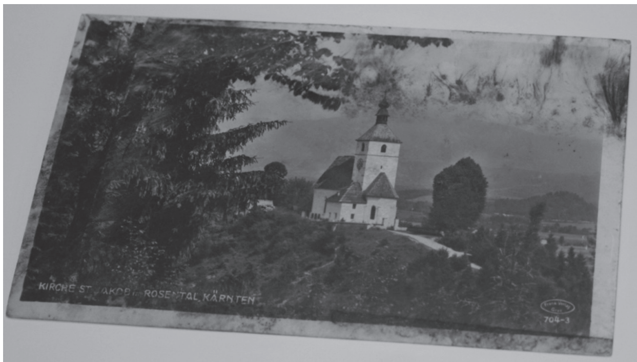
Figure 4: Mould on the front side of a silver gelatin black and white photograph dated 1931-1932, St. Jacob's Church, Rož / Rosental