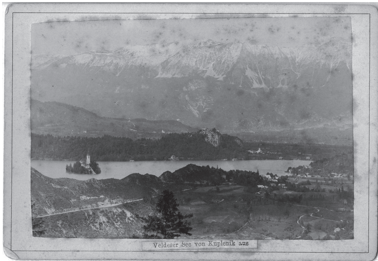
Figure 3: Foxing on the front and back side of an albumen photograph from the end of the 19 th century, view of Lake Bled

Foxing appears in old photographs as fine red-brown randomly dispersed stains on the paper primary support (see Fig. 3). Experts are still not absolutely certain why foxing occurs, but it is known that, like moulds, foxing appears in bright, warm and humid places.