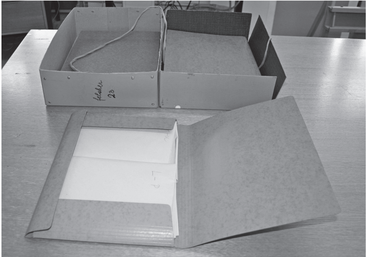
Figure 2: The photographs after being properly arranged: the archival box with open blue paperboard folder and the photographs placed in the letter envelopes

arranged, but most often they were simply tied up in bundles with other materials (see Fig. 2). When arranging and taking the inventory in the Archives, the material concerned and the photographs were stored in the aforementioned archival boxes; within the boxes, materials were subdivided and placed in paperboard flap folders, size A4, which are convenient for document filing. The photographs were put in letter envelopes for better protection.