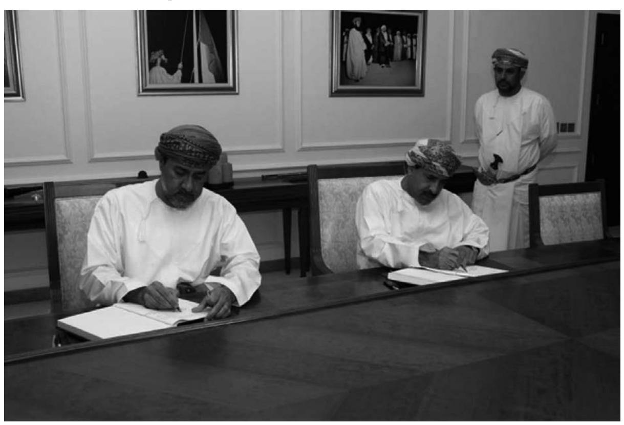
Image 1: Signing of an agreement between NRAA and Governmental agency

Since its establishment in 2009 NRAA is responsible for more than 38 governmental agencies. According to the Archival Act NRAA started to deal also with companies were the government share in their capital is not less than 25%. NRAA works with individual government agencies separately in order to organize their private records. The private records means different functions from one agency to another. In this process we have to prepare nominal list of records and files and retention schedules to make agencies aware of when the files are transferred to intermediate repository, and when to migrate them to NRAA to keep it forever or for the destruction.