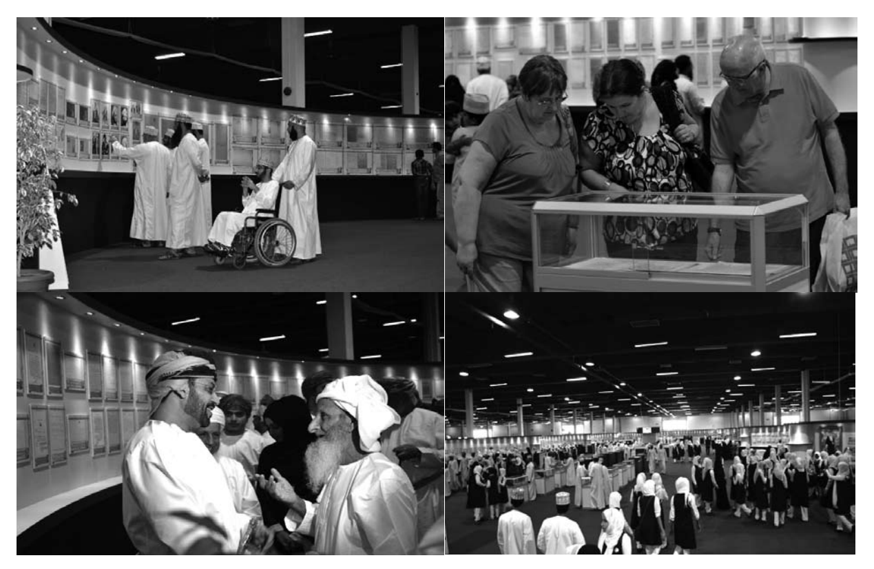
Image 7: Different type of visitors attracted by exhibitions organised by NRAA